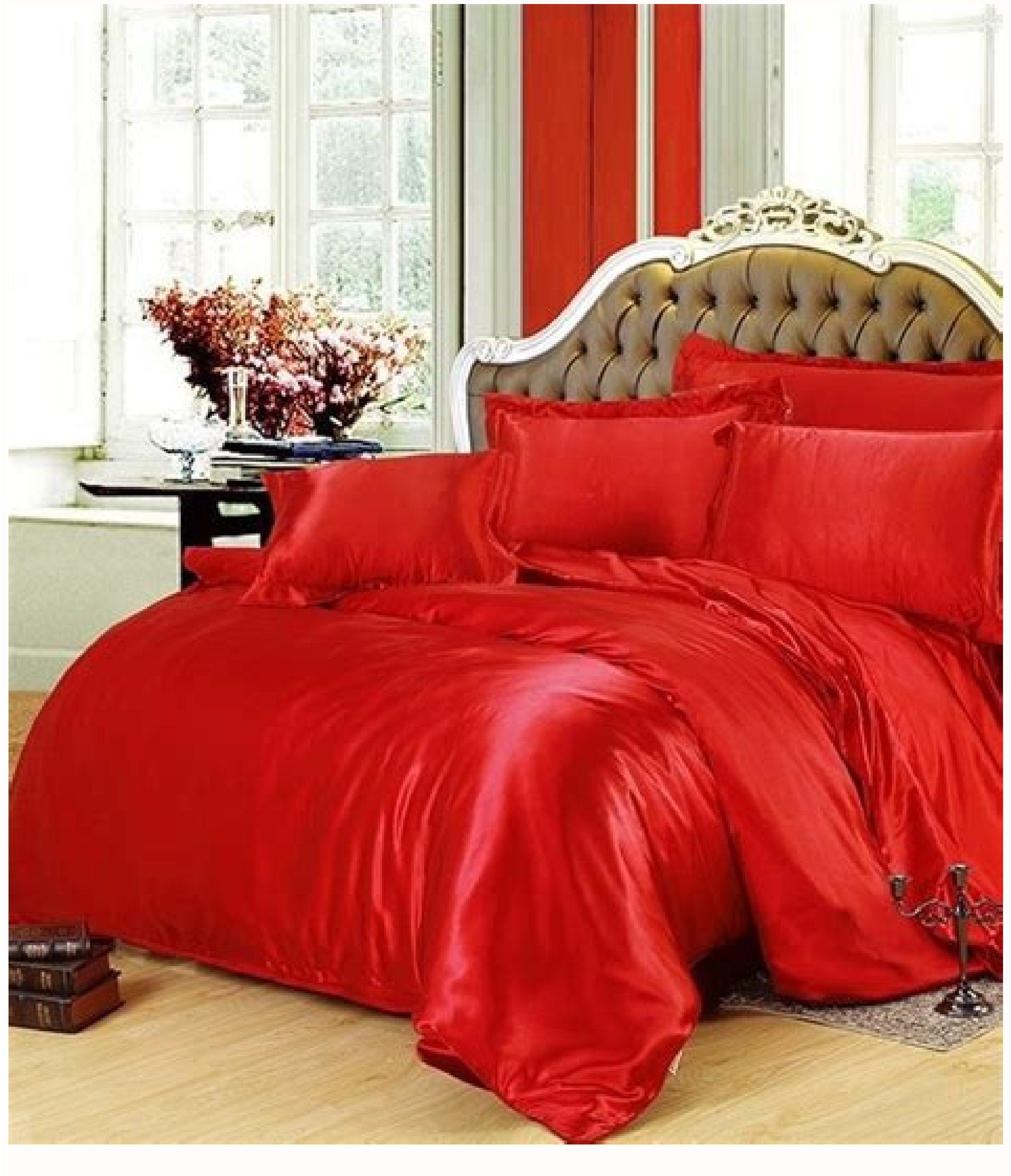
Bed fitted sheet size. Best waterproof bed sheet uk. Fitted sheet for double bed size.