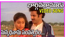
Nandamuri balakrishna video song movie.